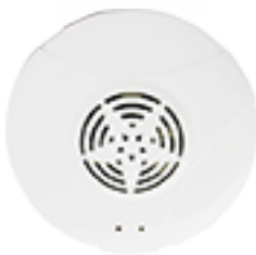
CH 2 O Detector