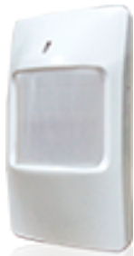
IR Motion Detector