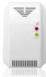
Door Sensor Detector