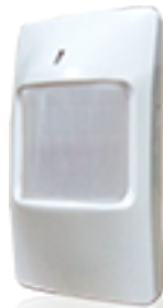
IR Motion Detector